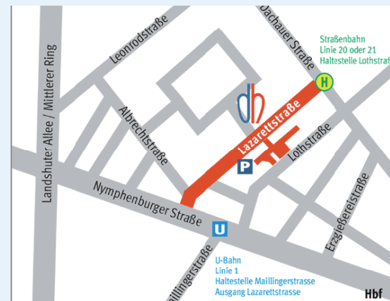
Map German Heart Centre, Lazarettstr. 36, 80636 Munich